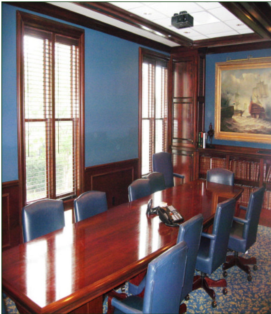
FIRST FLOOR CONFERENCE ROOM