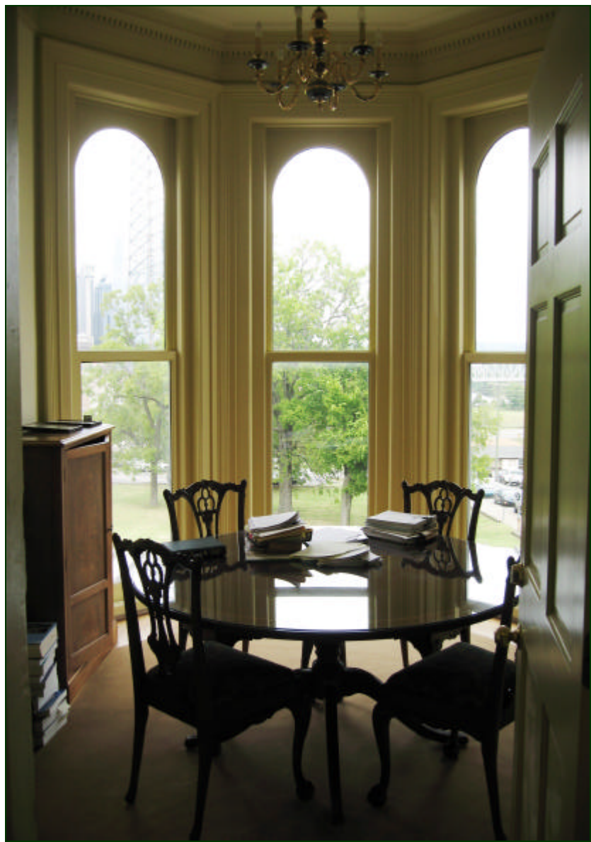
SECOND FLOOR OFFICE OVERLOOKING DOWNTOWN