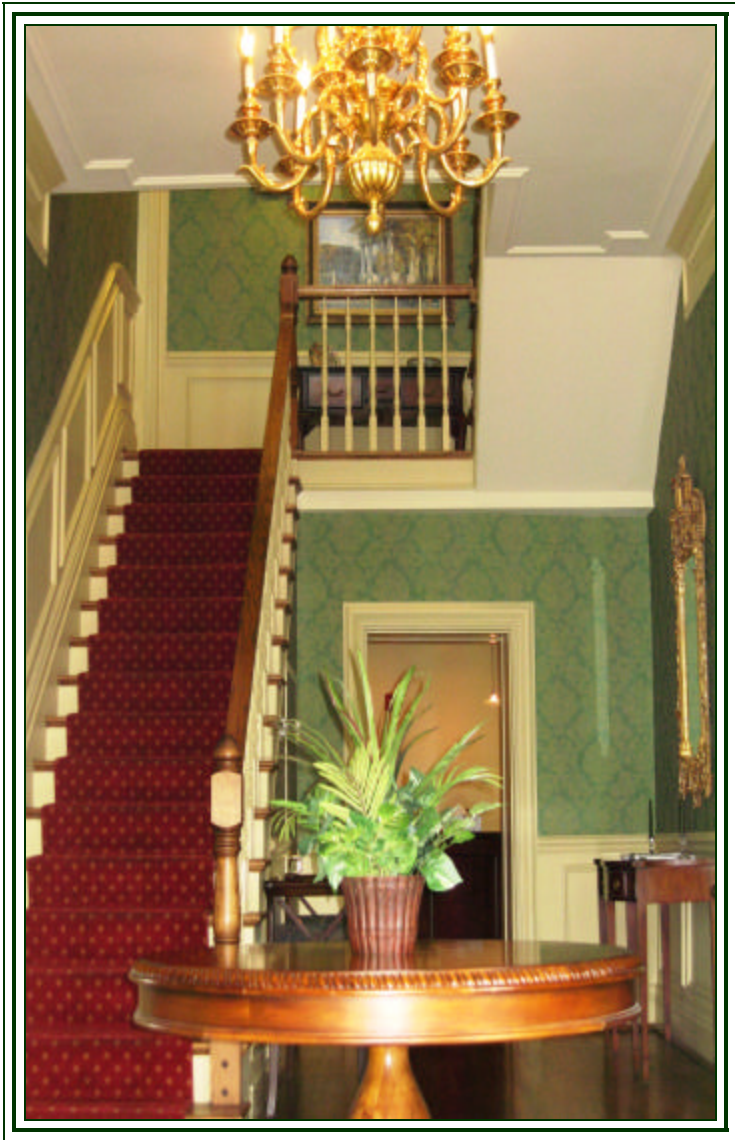
FRONT ENTRANCE FOYER