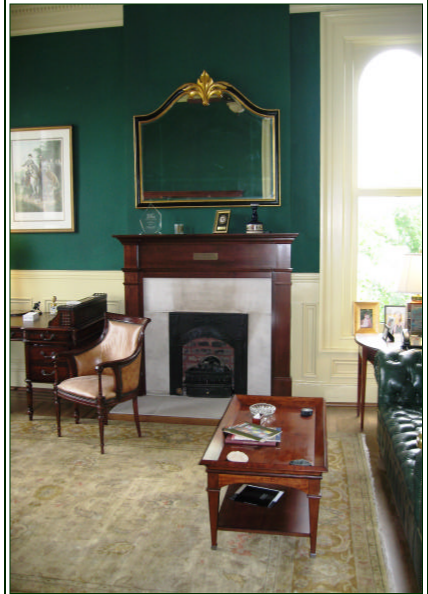
SECOND FLOOR OFFICE