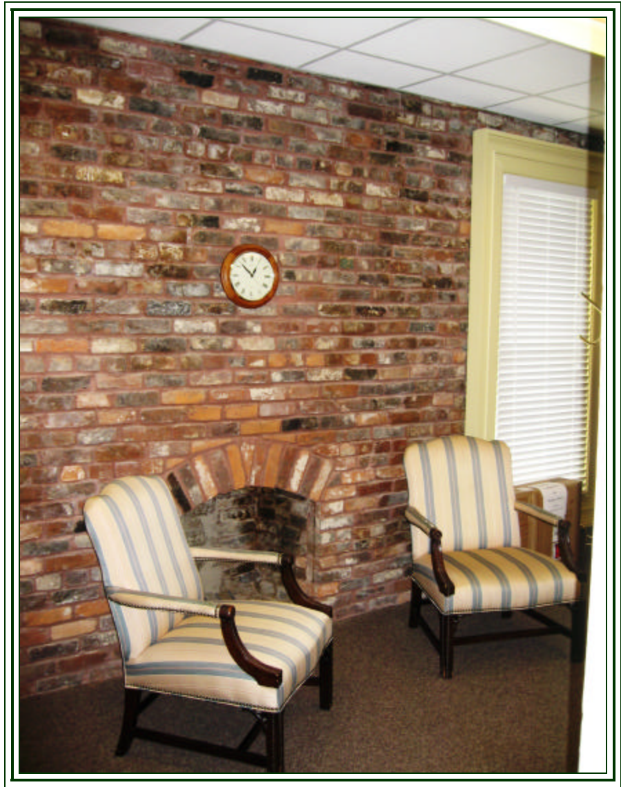
SECOND FLOOR OPEN WORK AREA