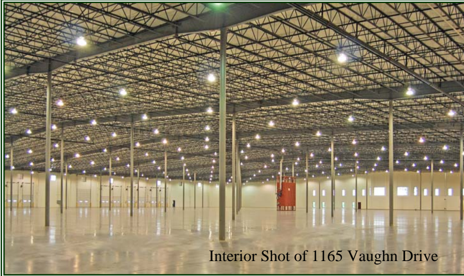
Interior Shot of 1165 Vaughn Drive