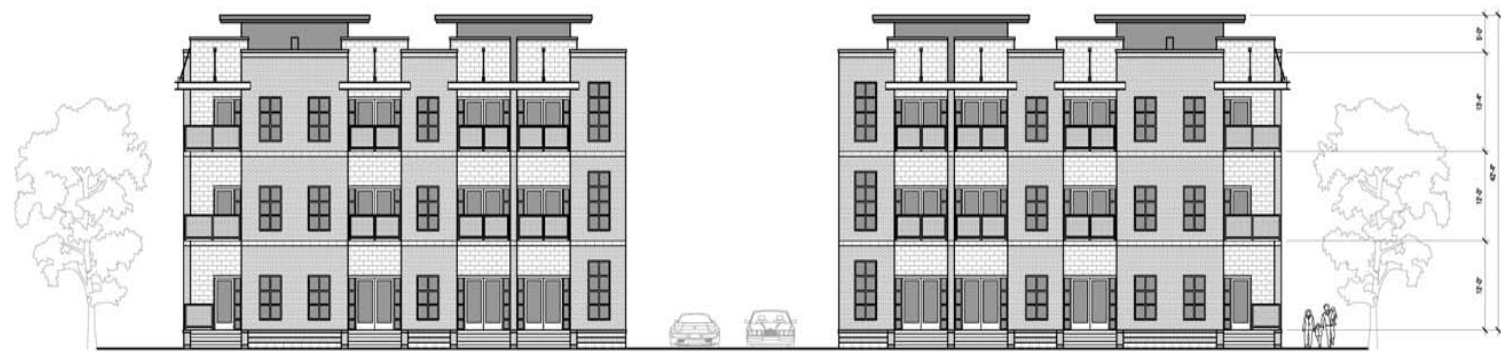
PROPOSED 1 EAST ELEVATION SCALE: 1/8" = 1'-0"