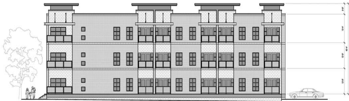
PROPOSED 2 NORTH ELEVATION SCALE: 1/8" = 1'-0"