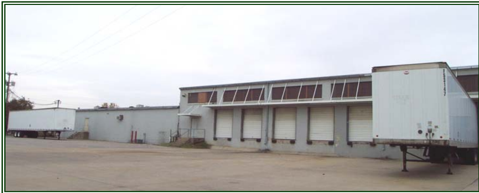
90 Oceanside Drive