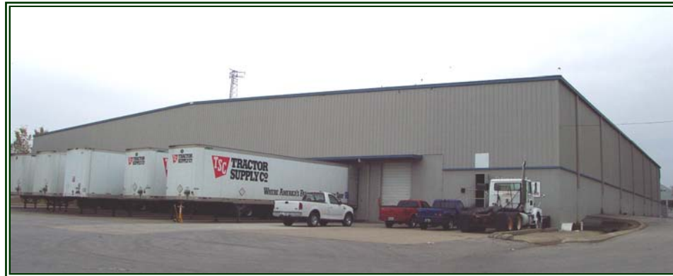
94 Oceanside Drive